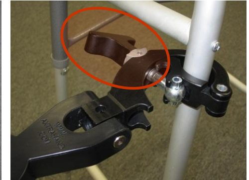
Attached to a Square / Horizontal bar